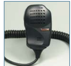
Mag One Remote Speaker Microphone PMMN4008