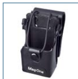
Mag One Hard Leather Case PMLN4742