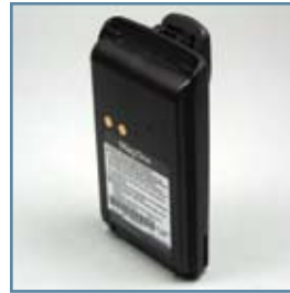
Mag One 1200mAh NiMH Battery PMNN4071_R