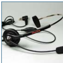
Mag One Ultra Lightweight Headset with In-line PTT/VOX Switch PMLN4445