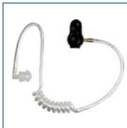
Clear Acoustic Tube PMLN4605