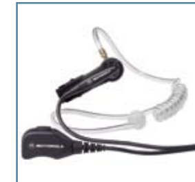
2-Wire Surveillance Kit with Clear Acoustic Tube PMLN4606