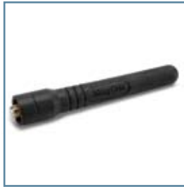
Mag One VHF 150-174 MHz Stubby Antenna PMAD4051_R