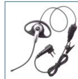
D-Shell Earset with Boom Microphone with PTT/VOX Switch PMLN4658