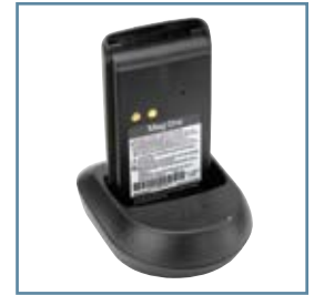
Mag One 6-hour Mid-rate Charger Kit (includes Base and Transformer) PMLN4738_R Mag One 12-hour Slow Charger Kit (not pictured, includes Base and Transformer) PMLN4683_R