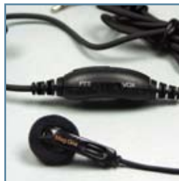
Mag One Earbud with In-line Microphone and PTT/VOX Switch PMLN4442