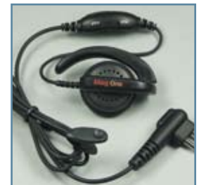
Mag One Ear Receiver with In-line Microphone and PTT/VOX Switch PMLN4443_B