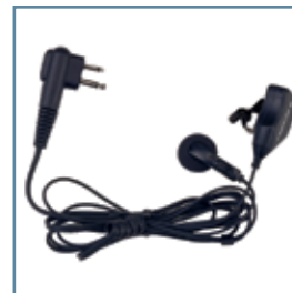
Earbud with Microphone and PTT Combined PMLN4294