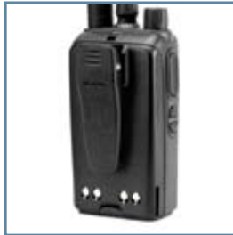
Mag One 2" Spring Belt Clip PMLN4743